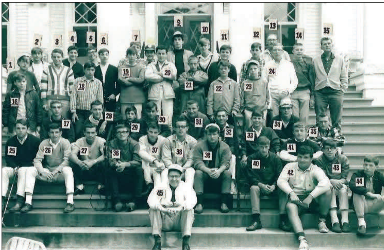
Exmoor Caddy Day, 1965 (see opposite page)